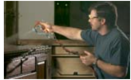
A superior finish with reduced overspray and VOC emissions.

Manufactured under an ISO 9001 Quality System.