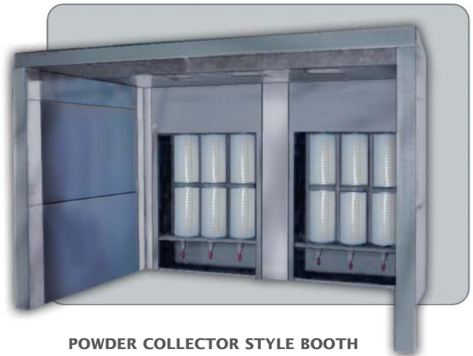
POWDER COLLECTOR STYLE BOOTH