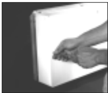
Rear Access Panel

UL and ETL listed in U.S. and Canada. Class I, Division 2, Groups A, B, C & D. Class II, Division 2, Groups F & G. Listed for damp locations. Listed for locations having deposits of readily combustible paint residues. For paint spray booth applications. Spring loaded lamp holders