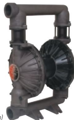
2 inch (50.8 mm) Husky 2150 Extended

All written and visual data contained in this document are based on the latest product information available at the time of publication. Graco reserves the right to make changes at any time without notice.