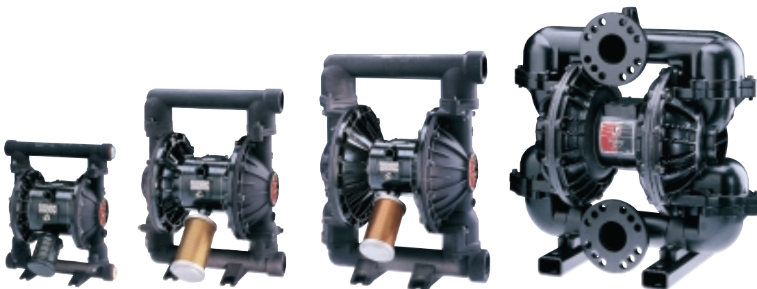
1 inch (25.4 mm) Husky 1040