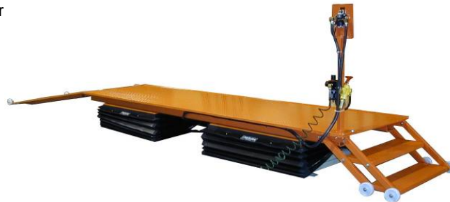
Line side operator lift