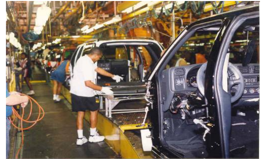
Position operators of different heights