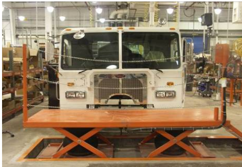
Position the operator for the application