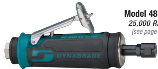
Model 48325 25,000 RPM (see page 2)

Dynabrade introduces .4 hp (298 W) Die Grinders with ALL-NEW design for peak efficiency and longer life! Ideal for rapid material removal, deburring, finishing and polishing, these new tools represent the FINEST in Dynabrade quality and innovation!