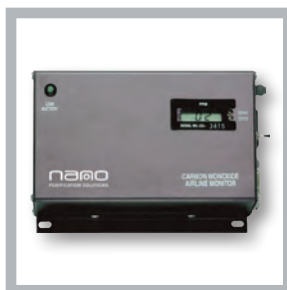
Stand alone CO & O 2 monitors