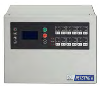
Optional Net$ync II