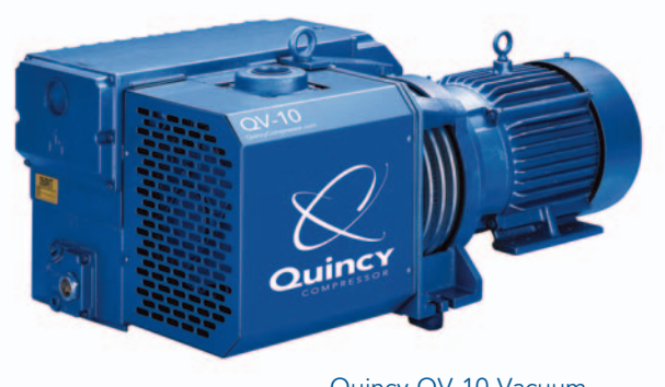
Quincy QV-10 Vacuum

The Quincy QV series vacuum pumps are designed to deliver enough volumetric capacity to meet the requirements of the most demanding applications. Each vacuum pump is a stand-alone supply system with the versatility to be easily relocated when needed. The Quincy QV can also be supplied as part of a simplex, duplex or triplex package. Tank mounting and stacked systems are available for installations where floor space is limited.