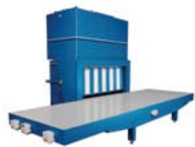
Integrated cantilever booth-base design allows for fast, easy leveling.

The integrated design of the Excel 2000 booth allows substantial factory pre-assembly of the booth prior to shipment to your plant. Factory pre-assembly reduces installation time and associated costs, and simplifies start-up.