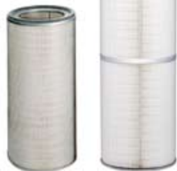
PowderGrid® Plus cartridges (right) used in the Excel 2000 booth are 38 percent longer than standard cellulose filters for longer life.

Plus, Nordson cartridge-filter recovery systems do not require expensive ductwork and explosion venting. Air used to contain and recover oversprayed powder is filtered through primary and final filters, and returned to the plant as clean air.