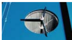
Center-mount design and unique seating plate set gasket automatically to eliminate leaks.