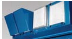
Internal mounting of final filters (shown with optional deflectors) provides for easy installation and maintenance.