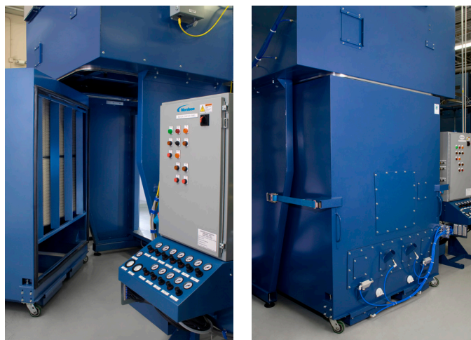
The compact and flexible color module design allows for a space saving footprint and easy to configure powder delivery options.

The compact and flexible color module design allows for a space saving, more compact footprint and easy to configure powder delivery options.