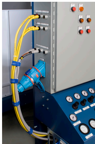
The Excel 3000 Powder Spray Booth features plug-and-spray technology that allows for fast and easy installation of all electrical components.

The Excel 3000 Powder Spray Booth features plug-and-spray technology that allows for fast and easy installation of all electrical connections. The durable and flexible molded cable and plug design means that there are no wires to terminate and no electrical connections to troubleshoot. All electrical devices come pre-wired for fast and easy connection – which means the Excel 3000 Powder Spray Booth is ready to spray – quickly and easily.