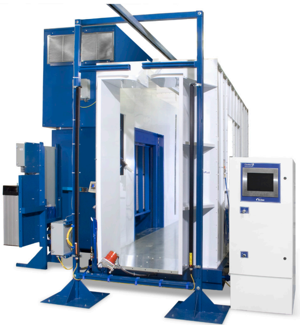
The modular design of the shorter more compact booth base allows for flexible location of both automatic and manual gun stations.

With plug-and-spray technology, low profile modular booth base, and optional PolyPlus™ canopy material, this innovative design provides large system features and benefits in a compact package that is easy to install, easy to operate, and easy to color change. The Excel 3000 Powder Spray Booth is available in 8,000 CFM, 10,800 CFM, and 14,000 CFM versions – in various modular and flexible system configurations.