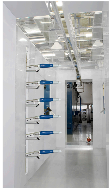
The optional PolyPlus™ wall panels provide enhanced light within the spray booth and low attraction of powder to the booth wall surface, allowing for fast, easy, and quick color change.

The durable yet functional canopy design features a clear copolymer roof for ample light during powder spray application and comes standard with PolyPlus wall panels. The PolyPlus wall panels provide enhanced light within the spray booth and low attraction of powder to the booth wall surface, allowing for fast, easy, and quick color changes. Booth walls are also available in optional stainless steel and feature the same sturdy design and construction as the standard galvanized steel wall panels. Each canopy material features a standard 2 ft. vestibule on both the exit and entrance end part openings for ample containment of powder within the booth.