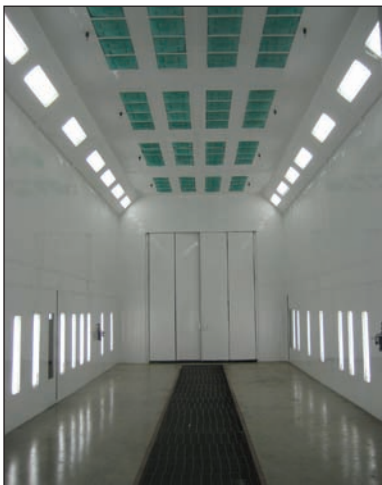
SHOWN WITH POWDER COATED WHITE OPTION