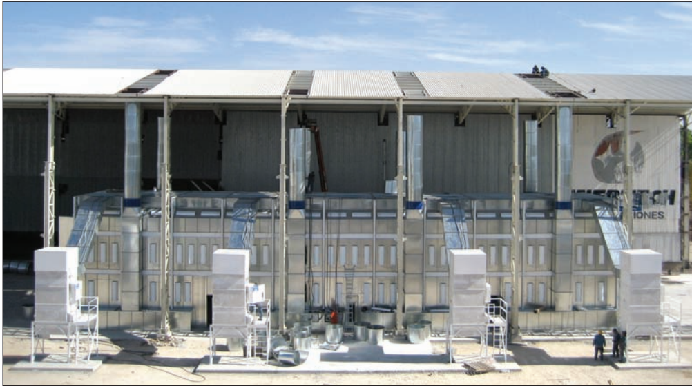
SHOWN WITH PRESSURIZED AIR APPLICATION