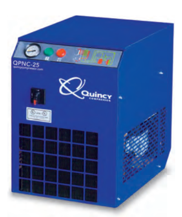
QPNC-25 Non-Cycling Dryer