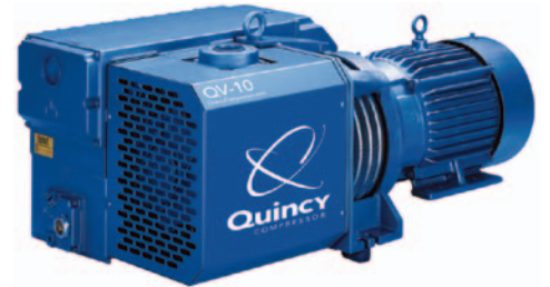
Quincy QV-10 Vacuum