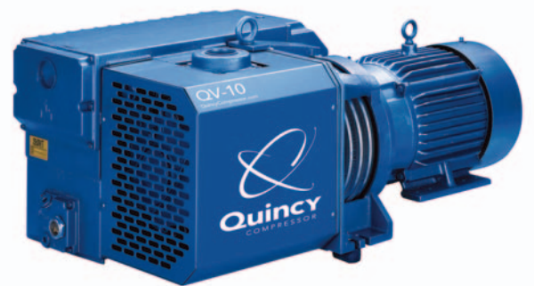
Quincy QV-10 Vacuum

Sound levels have become an extremely important consideration with rotating equipment. QV series vacuum pumps were designed to operate quietly so that installations can be made in areas where people are working in close proximity.