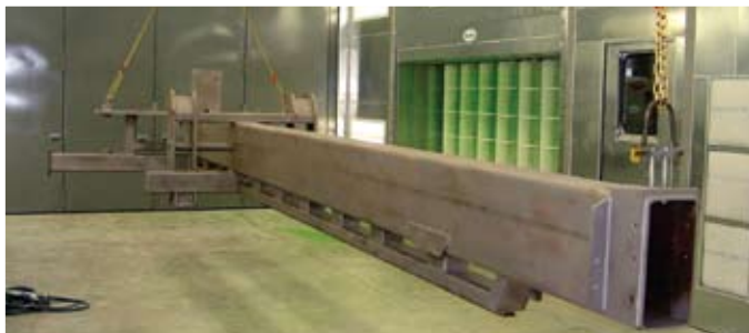
Even the largest walk-in booths for coating large agricultural components require no more than two Vantage modules compared to several conventional modules.